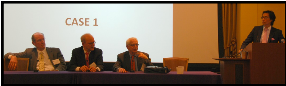
Pictured Above: Cosmetic Face and Neck Panel