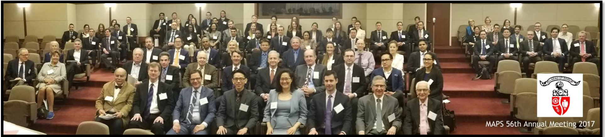
MAPS 56th Annual Meeting 2017